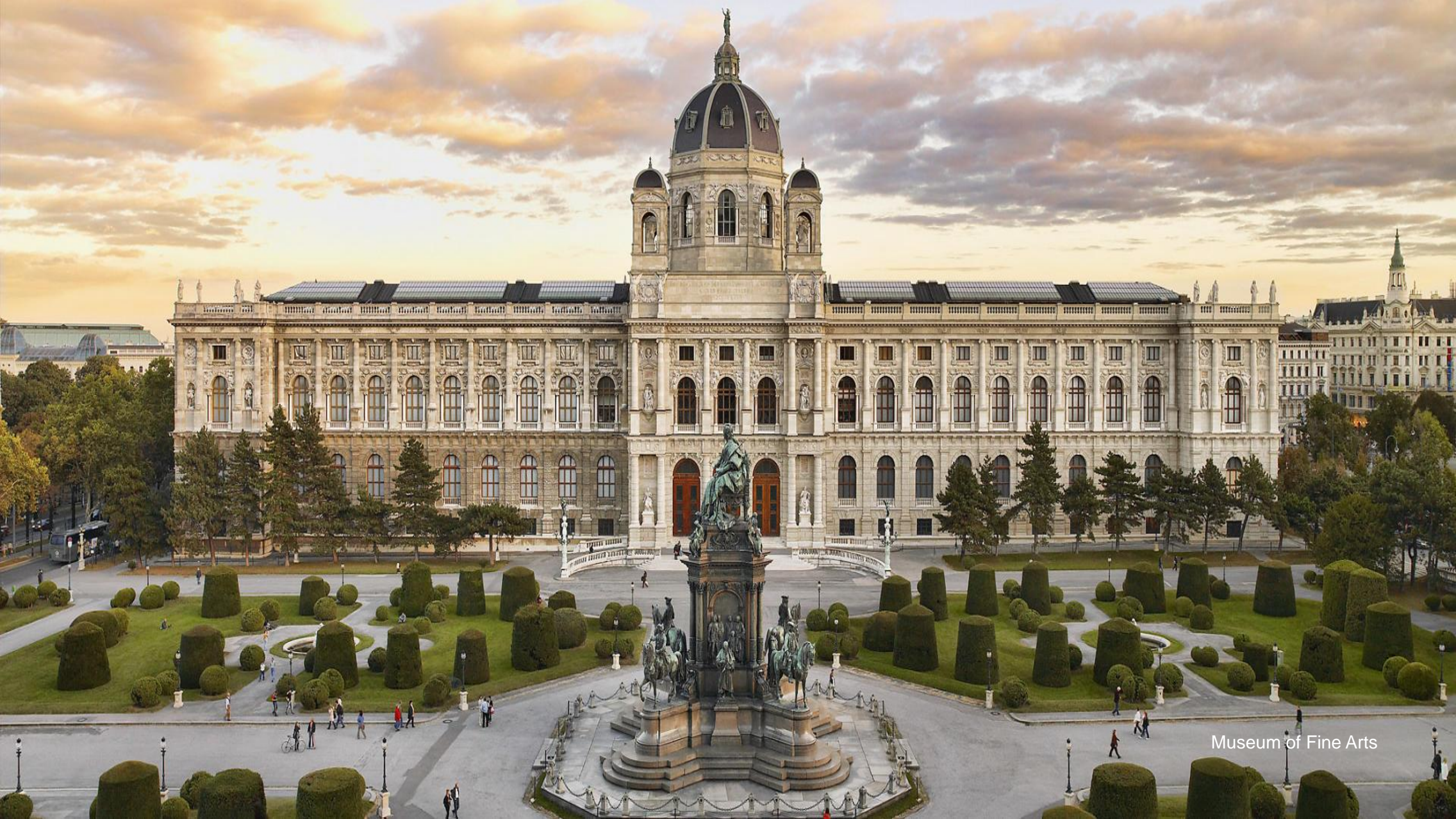
Museum of Fine Arts