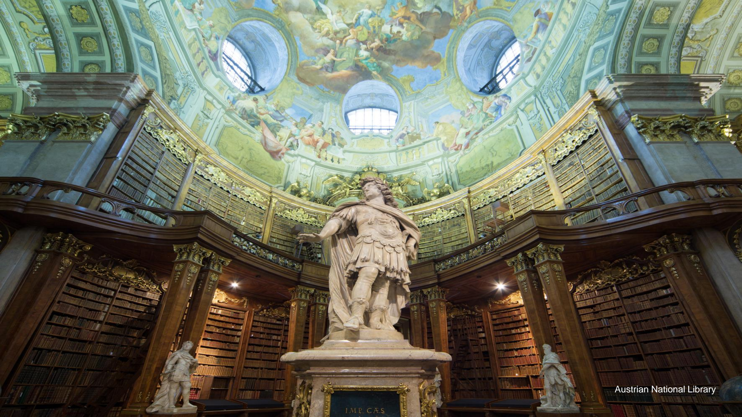
Austrian National Library