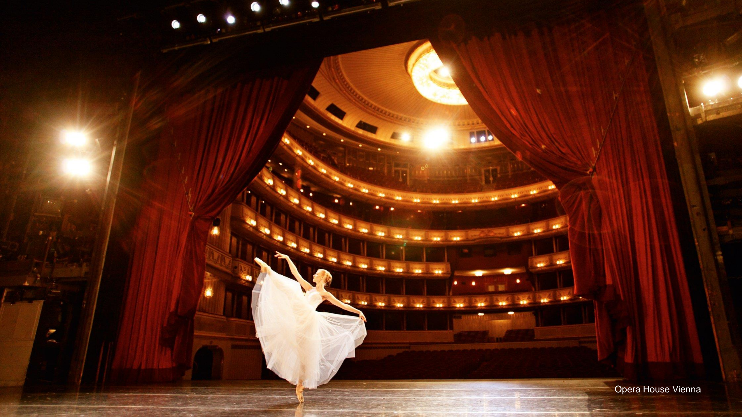
Opera House Vienna