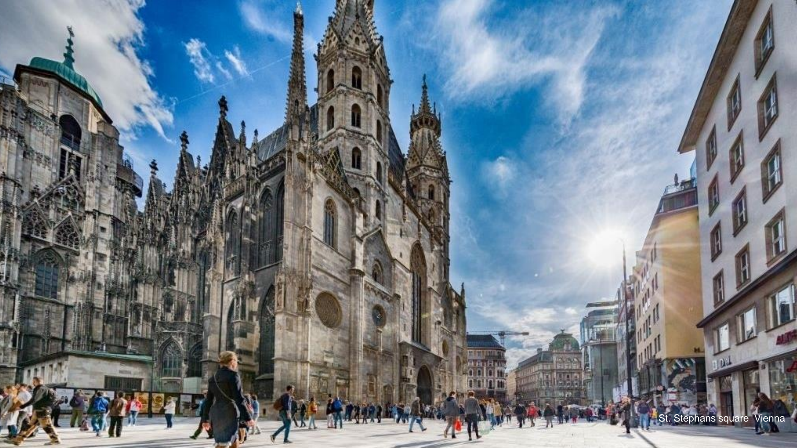
St. Stephens square Vienna