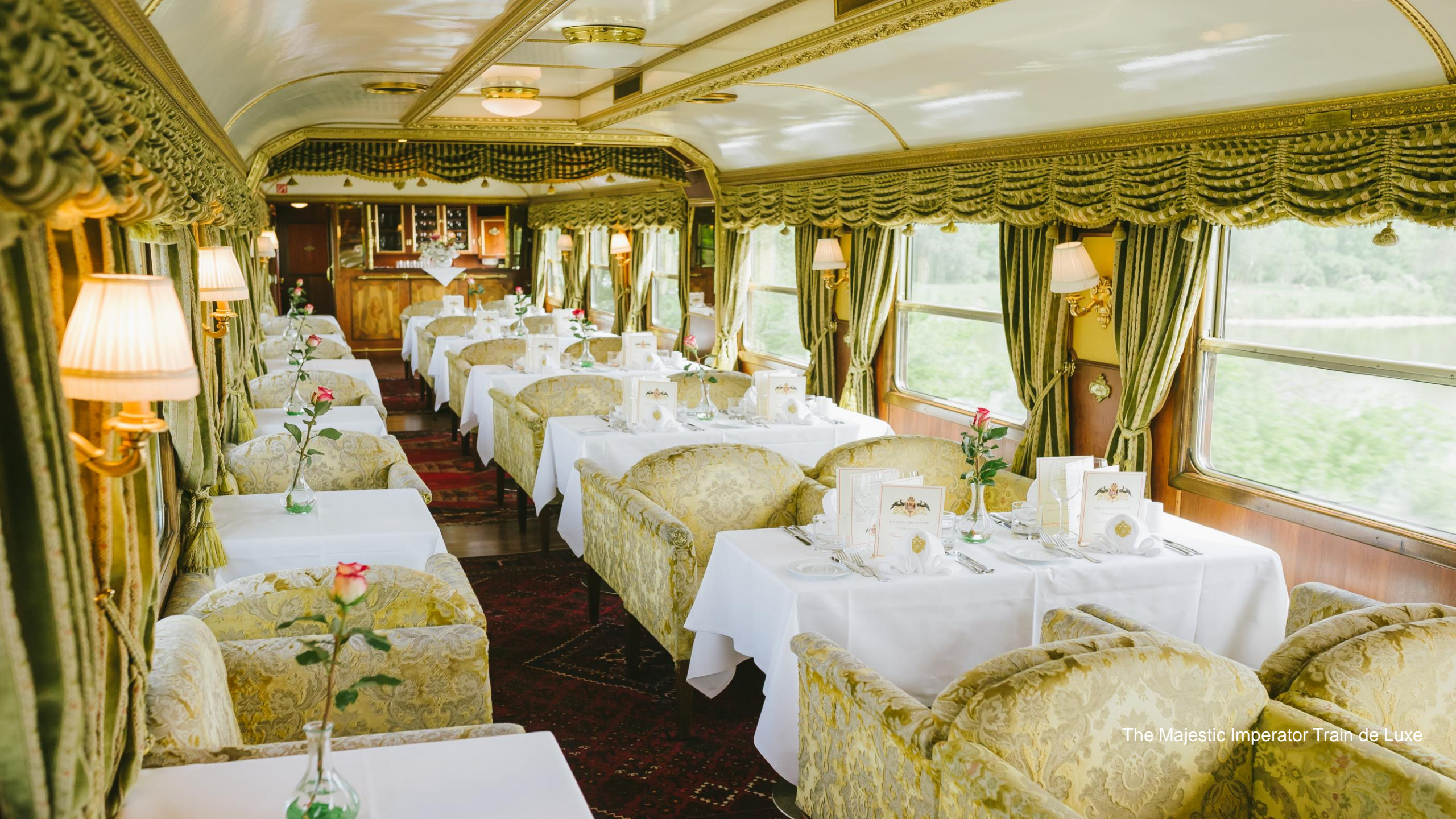
The Majestic Imperator Train de Luxe