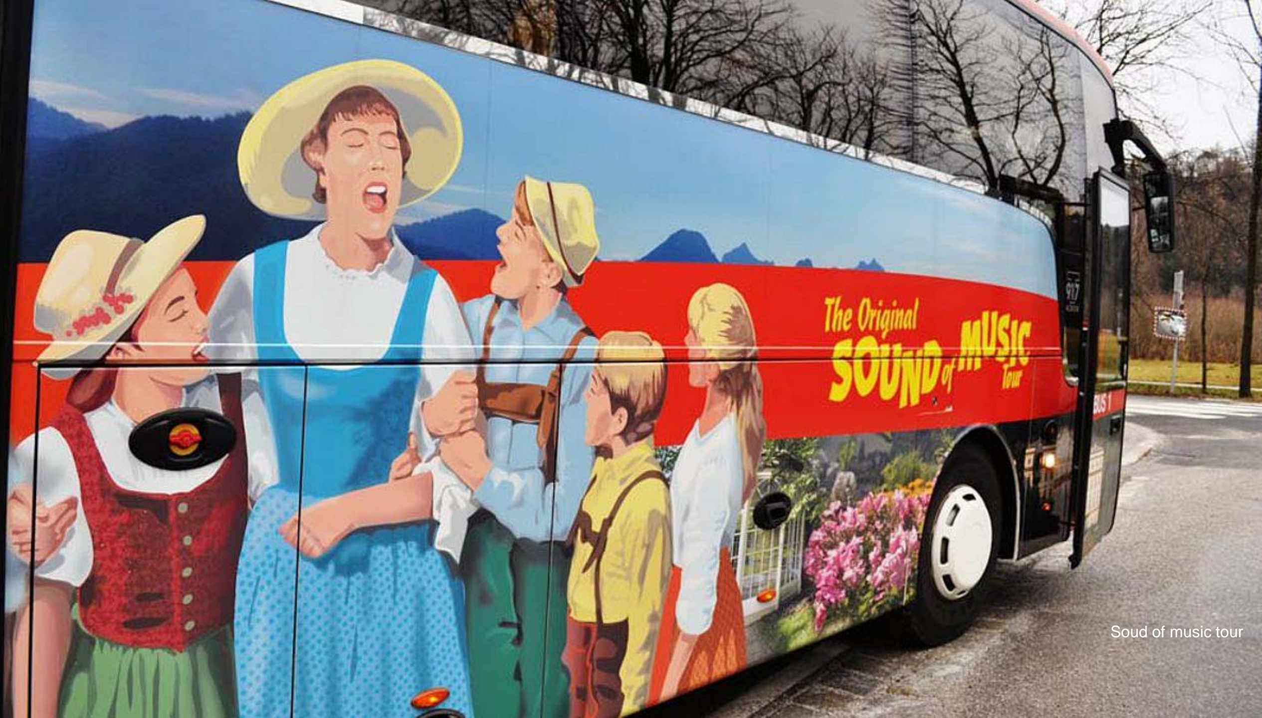
Soud of music tour