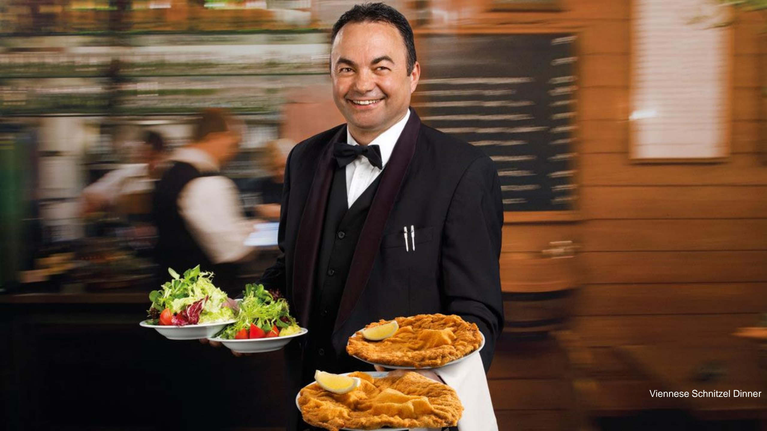
Viennese Schnitzel Dinner