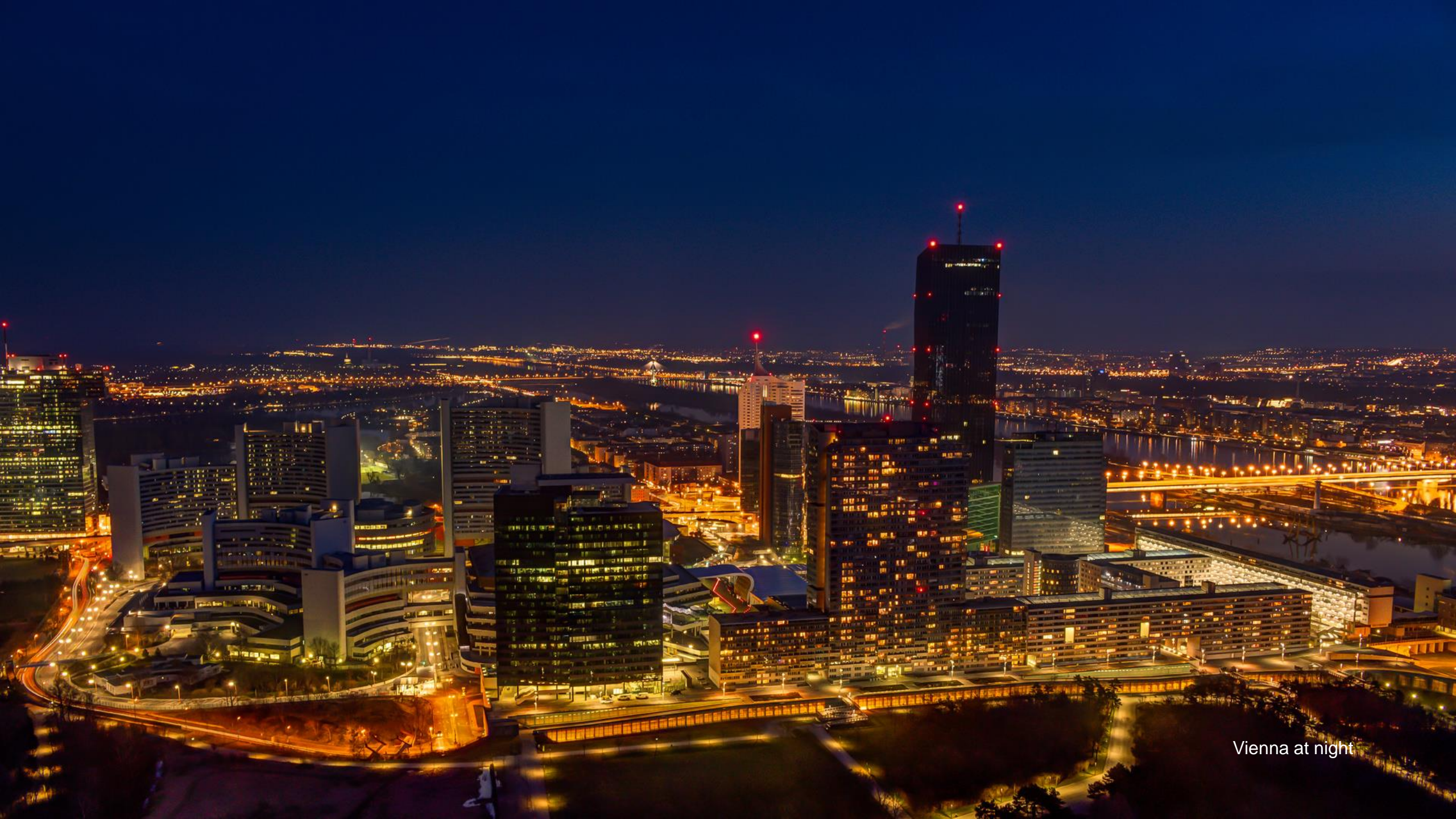
Vienna at night