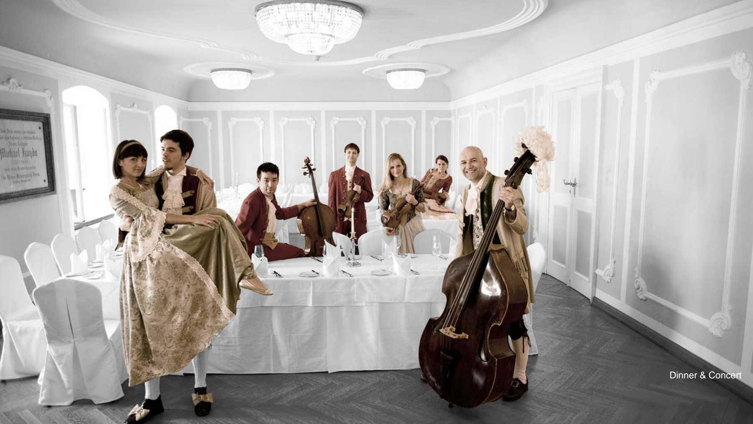
Dinner & Concert