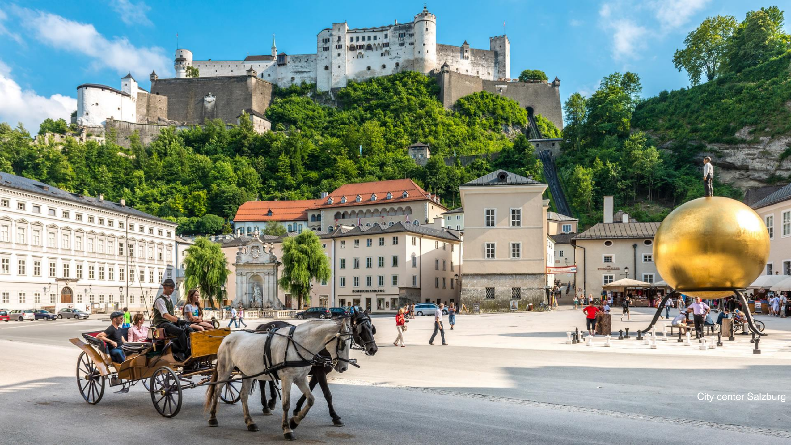
City center Salzburg