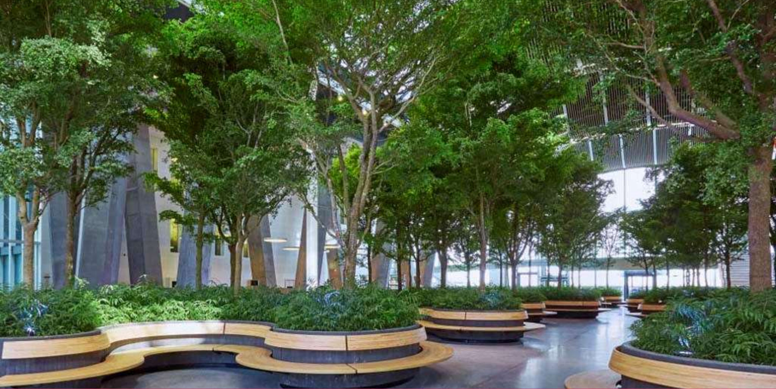
Hotel Crowne Plaza Copenhagen Towers