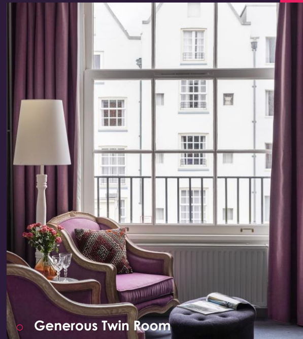
○ Generous Twin Room