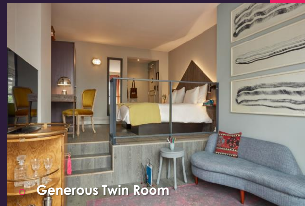
○ Generous Twin Room